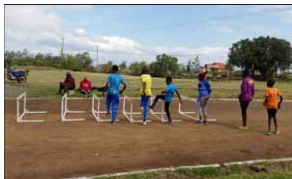
Our youth talents enjoy their new challenges

The children really enjoy our program and look forward to train with us. As the run2gether youth team they compete in their first races and we are very happy to see their names on top of the list.