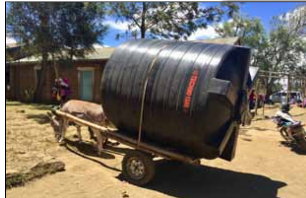
A new water tank for the school

This solution fulfills the criteria laid out by our club as we want the community to help itself locally.