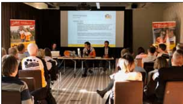
Presentation during the general meeting in Obertrum am See

In November of 2019 our general meeting took place during our club members-only weekend, which for the very first time included the election of the board members. The new board was elected unanimously by vote.