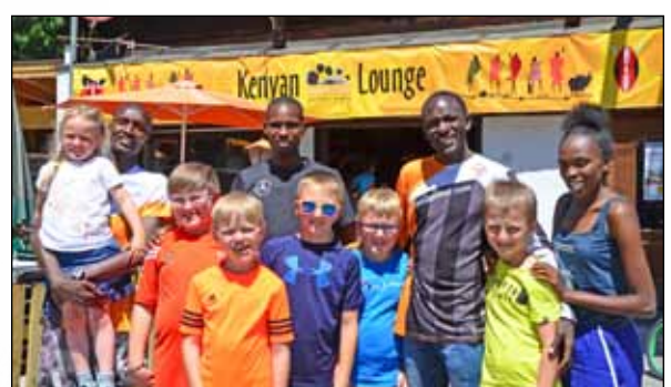
The local children from Kals pay a regular visit to our Kenyan Lounge

Wherever used in the course of the annual run2gether report a pronoun in the masculine gender shall be considered as including the feminine gender unless the context clearly indicates otherwise.