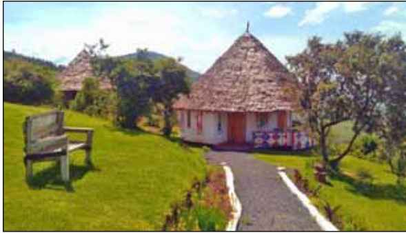
The camp now consists of two private houses