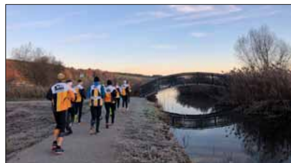
Atmospheric morning run at the members-only weekend in Obertrum am See