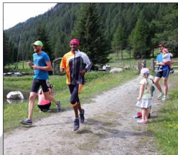
July 4 th of 2020 marks our first run2gether race in Austria

In Kenya we are currently planning to host a mountain race in 2020. Over the years we would like to develop our own mountain running series.