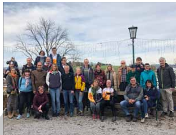
Enjoying each other's company at the members-only weekend