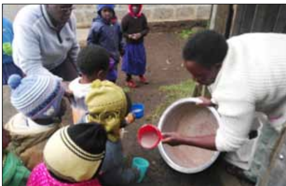
Porridge for the children at the Nursery School Sision