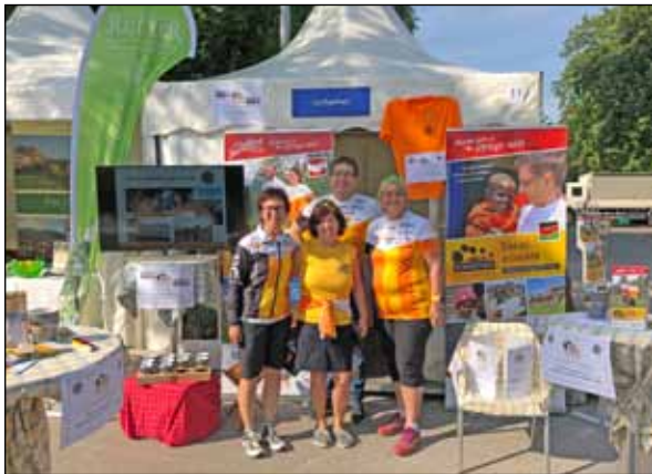
Our members were in charge of our stand at the Austrian Women's Run