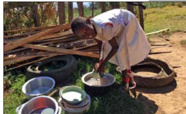
Water is scarce; therefore it must be used wisely