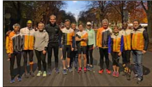
Thursday 6.30 pm: Time to run in Vienna