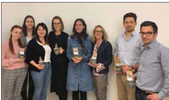
run2gether says thank you to the organizers of the Austrian Women's Run

Another big thank you goes out to the Gemeinnützigen Bau- und Siedlungsgenossenschaft Frieden in Wien , which supports us with a rather special sponsoring since 2019. We now have the possibility to accommodate our athletes in a flat in Vienna all year around.