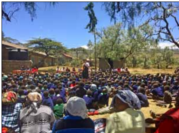
All that we do goes directly to the community in Kiambogo