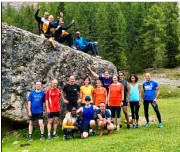
The running week in Alto Adige – a fixed component of our summer