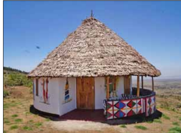
The new Makuti house is extremely popular with our guests

After extensive renovations and expansion work in the sanitary facilities, as well as the new construction of the Makuti house with a separate shower and toilet we are happy to see our Mount Longonot Sports & Recreation Centre in Kiambogo with a new look. The increase of bookings for the Makuti house have brought us to the decision to build a second house with space for up to four people. Therefore from February 2020 onwards we have the possibility to host another four people in another chalet-like home in Kiambogo.