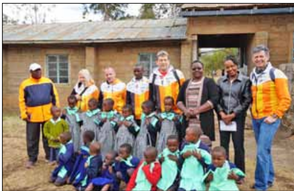
New school uniforms for all run2gether children

Thanks to all of our supporters who made it possible for us to take care of this!