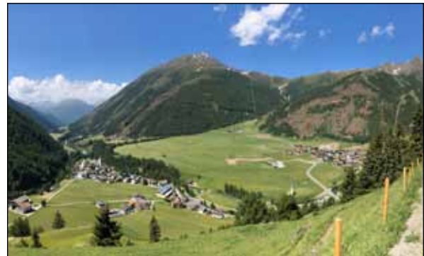
Kals offers scenic running routes

The openness and warmth of the local community in Kals am Großglockner was overwhelming for us. We are extremely happy to have found such a special place for our Kenyan runners, our guests and our club members and we appreciate the many interactions that we have made so far. It is a great honor for our athletes to be part of such a great community and we could not ask for more than acceptance and integration. We hope that 2019 marked a great year to create a base for a long-term cooperation with Osttirol. Our Kenyan runners fell in love with this beautiful place, the great training opportunities and the integration into the local community.