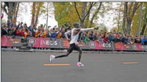
run2gether members witness Kipchoge's 1:59:40,2 in Vienna