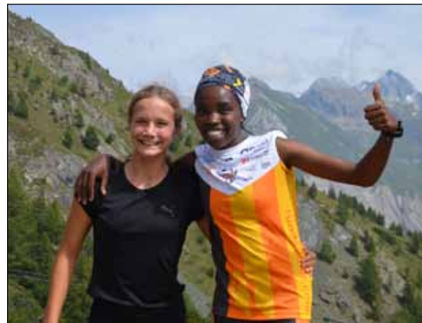
Sharing great moments through running