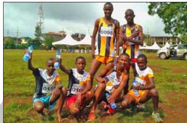
First success story of our youth team

work with athletes who do not only have athletic potential but also the willingness to change things for the better socially . We will face this on various levels and will make sure to bring this motto to each and every attendee of our “run2gether Athletics Academy” .