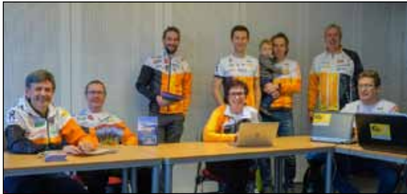
run2gether board members at the strategy workshop in Vienna

Every year our board members come together for a strategic workshop to talk about the most important club news. This time it took place in Vienna in the beginning of January 2020. The focus of this workshop was mostly put on administrative news, the development of our three pillars and the professionalization of them. We thank each and every one of our members for their time and Raiffeisen Informatik for letting us use their conference room!