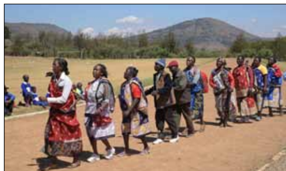
The parents prepared a traditional Kenyan dance for the festival

After the official opening of the children's festival we were stunned by a traditional Kenyan dance and musical performance which was initiated by a group of parents. In the course of the day the children were put in different groups and spend a good 90 minutes full with play, fun, art and of course movement. The children had to go through six different play stations which were led by two of our athletes each.