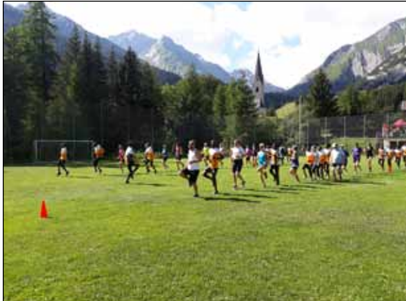
Technical training in Kals