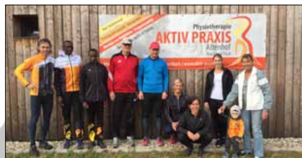
Physiotherapeutic support – essential for our athletes

In the past year we hosted 46 athletes over ten months in Europe. More than half of the 124 races were coordinated