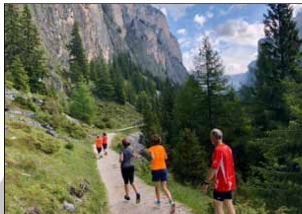
Scenic running routes are highlights of our running weeks

Book your stay at our running camp in the Grödner Valley or Kals am Großglockner and experience an individual training with some of the best runners in the world!