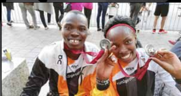
No races and therefore no prize money for our athletes this year

However, the financial means of run2gether are limited and we hope for your help!