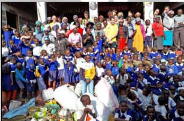
Primary School Sision visiting run2gether camp